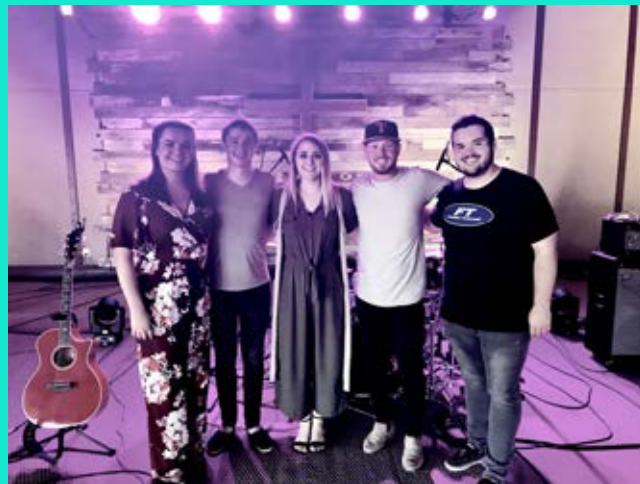
The KD Collective Encounter 1&2