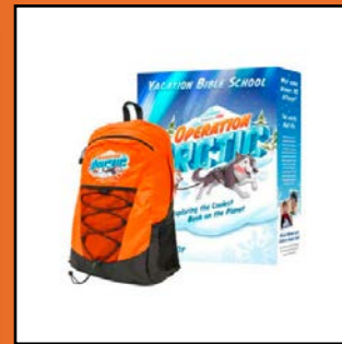
Operation Arctic Kit $189.00

Randall House – 800-877-7030 or Randallhouse.com