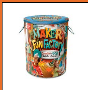
Maker Fun Factory Kit $179.99