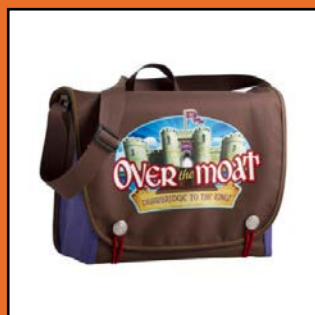
Over The Moat Kit $109.99