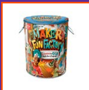
Maker Fun Factory Kit $179.99