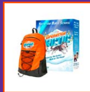
Operation Arctic Kit $189.00

Randall House – 800-877-7030 or Randallhouse.com