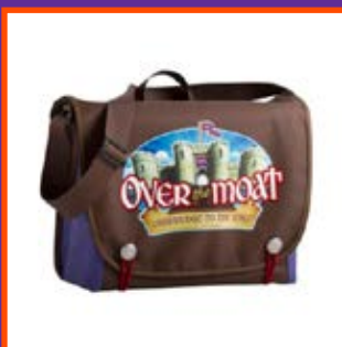
Over The Moat Kit $109.99