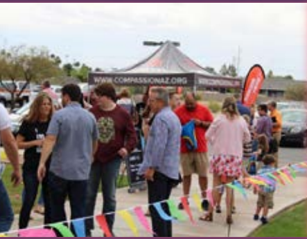
Compassion Church in Gilbert, Arizona Over 500 in attendance and 20 saved