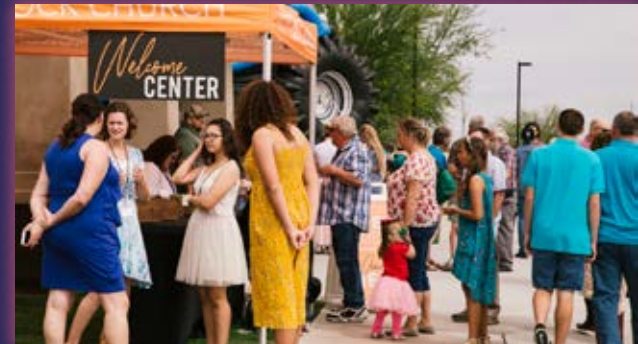
Dessert Rock in Florence, Arizona 320 in attendance and 10 life change commitments